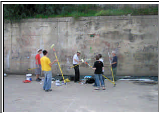
See Shaun's update later in this issue for finished mural